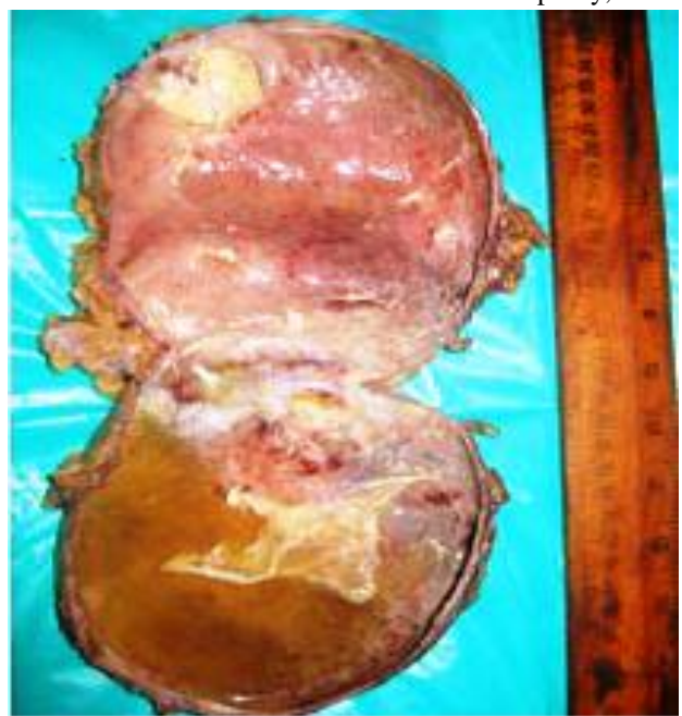
Fig1: Gross picture of Cut Opened Tuberculous Breast Cyst. Cavity contains serous fluid. Mural nodule 2 x2 cm shows caseous necrosis.

rare sites of extrapulmonary mycobacterial infection comprising 0.1 - 0.5 % of all cases of tuberculosis. The age incidence is between 20 - 50 years (reproductive age group). 1,2,5 The various risk factors considered to be associated with tuberculous mastitis are multiparity,